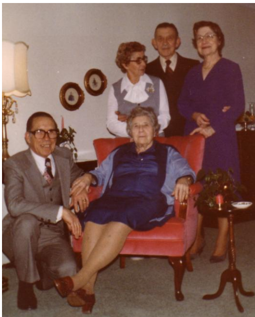
Hunts in Canada as shown on right

Where her home once stood in Walthamstow