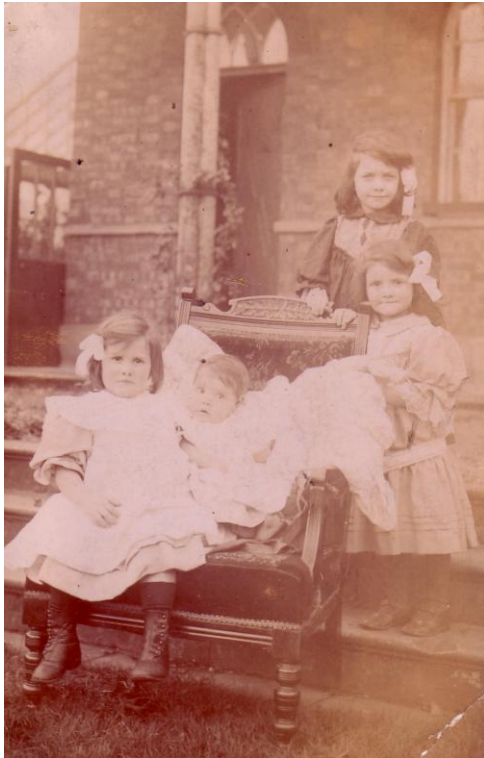
Some of the Hunts who went to Canada